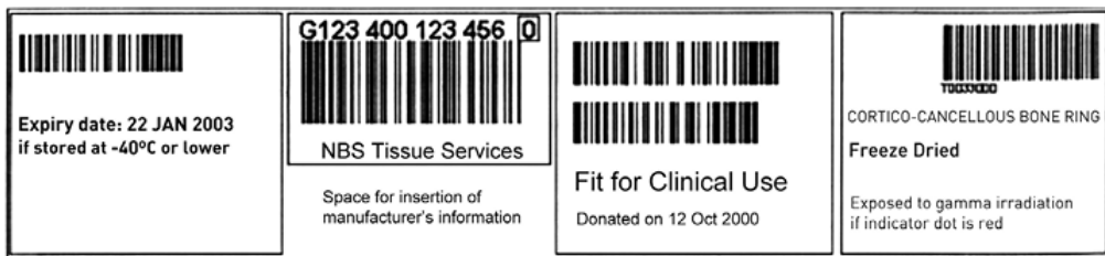
Figure 24.2 Label positioning: option 2 (example; not to scale)