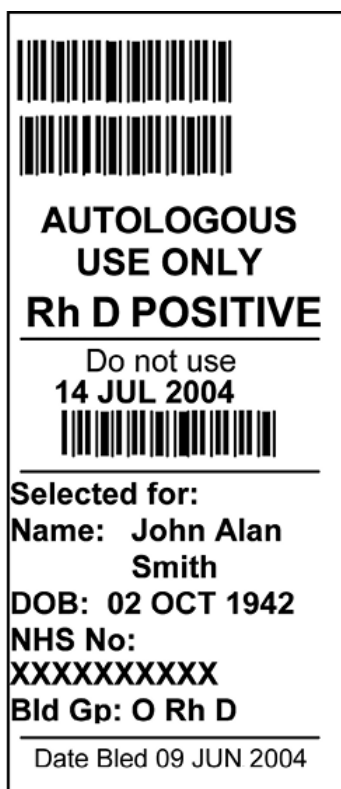
Figure 23.6: Label for unit with use limitations

Note: The NHS number is in use in England; other countries will have an equivalent patient identification system that will be used in its place. Where this is the case, the numbering system used must be clearly identified so as not to introduce any ambiguity.