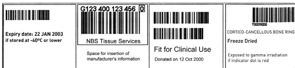
Figure 24.2 Label positioning: option 2 (example; not to scale)